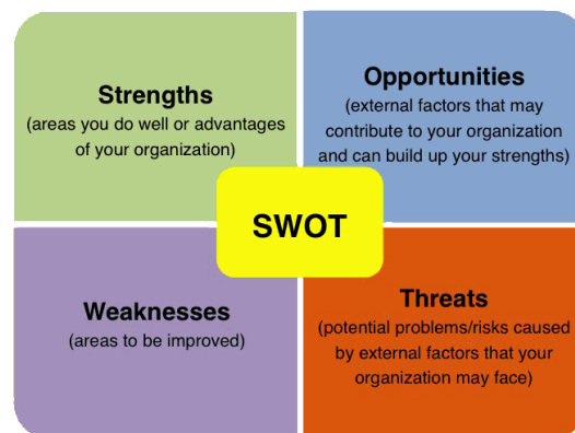
Fig.2 Swot analysis.