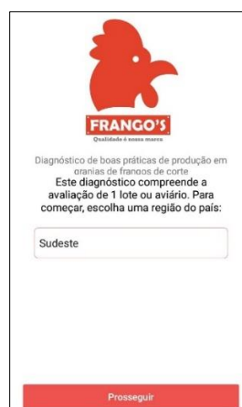
Fig.1 Frango's application interface

Scores are assigned to each specific demand about the requirement in international codes, ranging from 1 to 5, such as 1 = very poor (there are no rules on this subject compared to international standards), 2 = poor (there are few standards and little or no compliance), 3 = medium (there are standards for at least half of the international standard), 4 = good (there are a lot of rules and regulations on various events during transport and a good degree of compliance), 5 = very good.